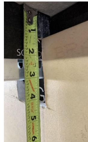
1.50" - Extended Gap (FRG)