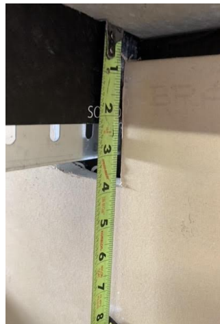
3/4" – Deflection (DIG)